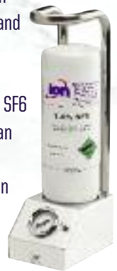
CalCheck Part no. A-21520

The CalCheck provides simple calibration of both the SF 6 GasCheck P1 and LeakCheck P1:p and is available as an accessory. Follow on-screen instructions to be taken through the calibration process. For more information see page 4.