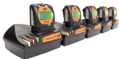
Cub's linked together within their docking stations.

When worker exposure exceeds pre-set limits the instrument's audible, vibrating and flashing LED alarms alert you to the gases present. Readings are displayed in ppb and ppm on its bright, back-lit LCD display with selectable data logging time.