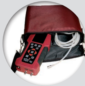
Convenient nylon bag