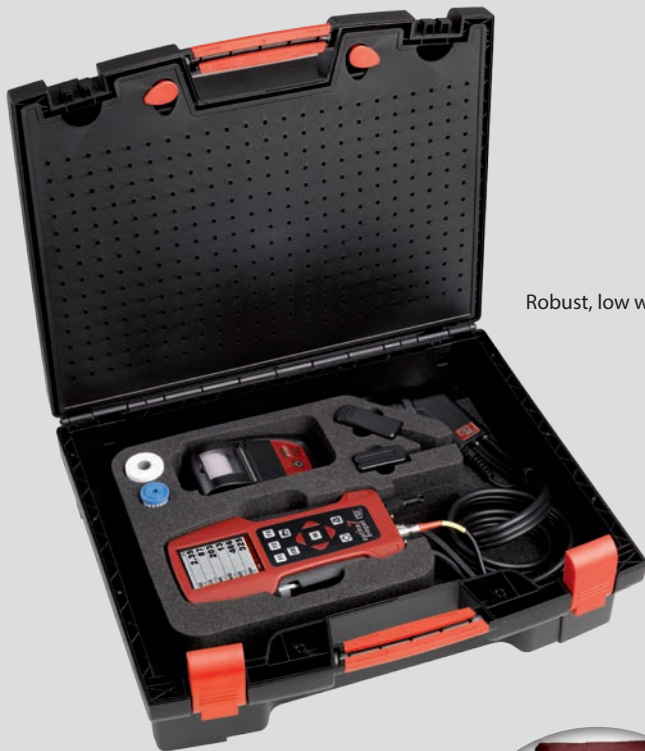
Robust, low weight case